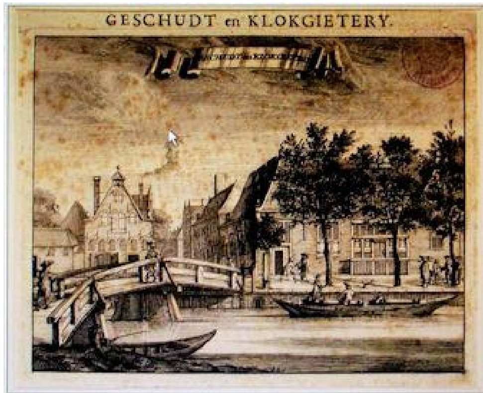
Behind the trees: The Amsterdam Gun- and Bell Foundry at the Lijnbaansgracht

The contract deals with the premises too. The building consisted of a workshop and a house. Thus far the Fremy family had taken up residence in the house. But in 1699 some of the rooms were assigned to the Noorden household and it was emphasized that the attic, cellar, garden and the rainwater tank were for communal use.