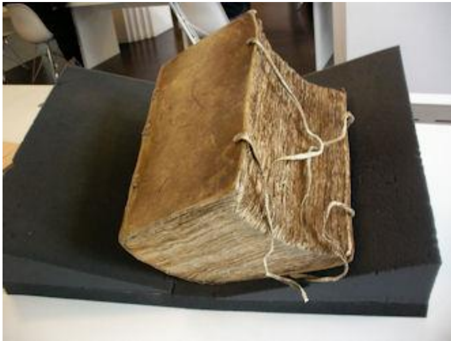
City Archives of Amsterdam, Notary archives 5075, File 3964, Acte 320, Page 974-977