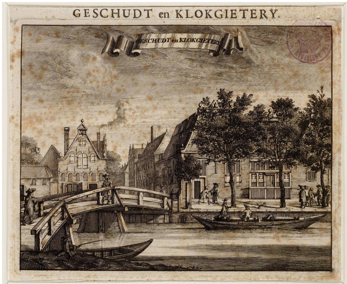
Behind the trees: The Amsterdam Gun- and Bell Foundry at the Lijnbaansgracht

The contract deals with the premises too. The building consisted of a workshop and a house. Thus far the Fremy family had taken up residence in the house. But in 1699 some of the rooms were assigned to the Noorden household and it was emphasized that the attic, cellar, garden and the rainwater tank were for communal use.