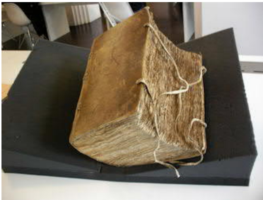
City Archives of Amsterdam, Notary archives 5075, File 3964, Acte 320, Page 974-977